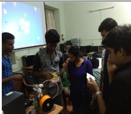
3D Printing workshop

The NSS unit of GEC was nominated as the best unit, because of its various activities in and outside the campus of the college. They also planted trees in association with the open stage inauguration programme. The unit won two state level competitions at Genesis mega event.