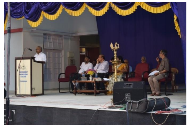
Inaugural Ceremony at “ Nadumuttam”